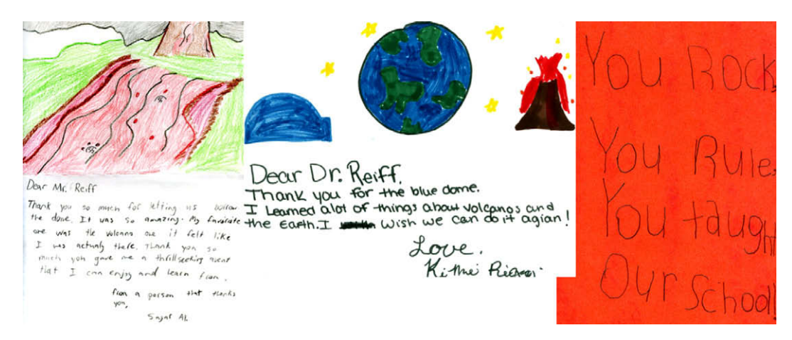
Fig. 2. A few of the thank-you notes we have gotten from students after the dome visits. Notes like these, and the "wow" looks on their faces, is more than enough reward for those of us who volunteer to teach with this unique system.

Mars (K-8): Mars missions and their results (license fees paid by HMNS).